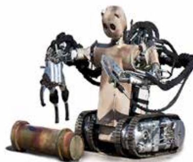
Figure 2. Battlefield Extraction Assist Robot

UGVs are by definition, UVs that operate on the ground, however when armed, they are commonly referred to as unmanned weapons systems (UWS). Under the UV category, though in a class of their own, also under the RGP, which are either quadrupedic or bipedic 'robots', and unlike their UGV 'cousins' they use robotic limbs, rather than a wheel or tracked-chassis, to achieve movement. In general, UGVs and RGP were designed specifically for dangerous missions, where a human operator could not be used. Similarly to UAVs, UGVs generally have onboard sensors to scan and monitor their environment, usually achieved either completely autonomously or via a human 'controller' located in another location. This distinction provides the two main categories under which UGVs and RGP generally operate, those being; remotely-operated and autonomous.