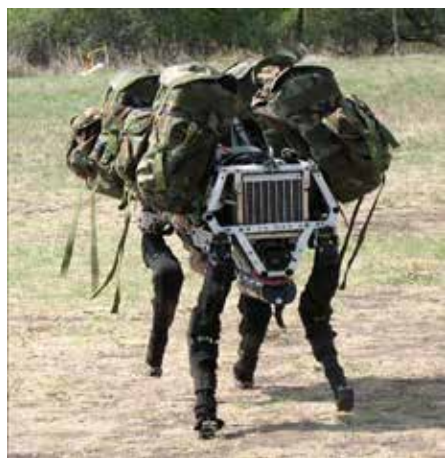
Figure 4. BigDog Robot

An innovative autonomous RGP is the US Army's 'Big Dog' (Figure 4), 27 which is a robotic quadruped, designed to carry equipment for ground troops and medics over difficult or rough terrain. Also known in the US Army as the 'Multifunctional Utility/Logistics and Equipment' robot or 'MULE'. Weighing 110kgs and standing 0.76m tall, it can carry 154kgs at an average speed of 6km/h, and climb hills at an incline of up to 35 degrees. 27 Big Dog has the capability to jump over low obstructions, climb over low vertical obstacles, walk on ice and importantly, it never falls off its feet. 27