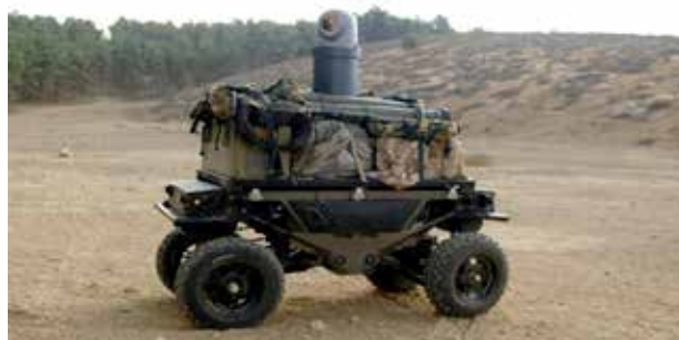
Figure 3. 'Rex' porter UGV.

Essentially, the REX UGV follows the soldier or medic that operates it remotely. Alternatively REX can be programmed to trail soldiers up to 6 metres away, via use of a small remote control device. 23 The functionality of these systems has not only enhanced the performance of infantry combat units in the field (as soldiers can carry more supplies to accomplish their mission) but it has also enhanced the 'mobility' of field medical missions, particularly where the REX UGV has an RSS on board. In terms of operability, the REX UGV is hard-wired to move at the same pace as that of the soldiers or medics on patrol, to come to a stop when required, and to either reduce or increase its operating speed. 23,24